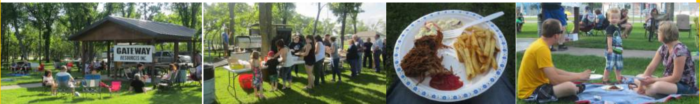
An enjoyable evening spent with co-workers/family eating good food, winning prizes, going swimming...